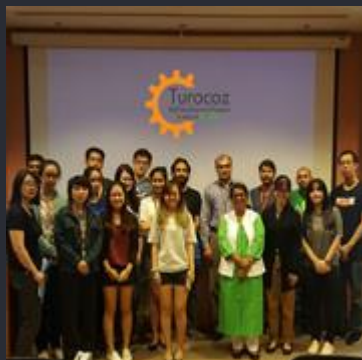
Workshop on Medical Writing