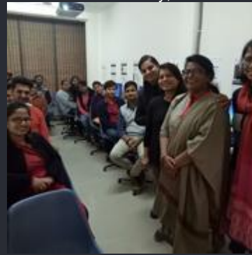
Course on Basic course in medical writing and pharmacovigilance Location: Gurugram Date: 6th January 2018

Observational Studies Location: Dr.Ram Manohar Lohia Hospital, New Delhi Date: 20th May, 2017