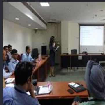
Workshop on ABC of Publications with Special Focus on