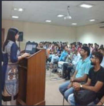
Seminar on Career opportunities in Life sciences Sector Location: Apeejay Stya University, Gurugram Date: 13th Oct, 2017

Location: National University of Singapore Date: 12th Oct, 2016